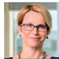
Emma Walmsley NED Diageo